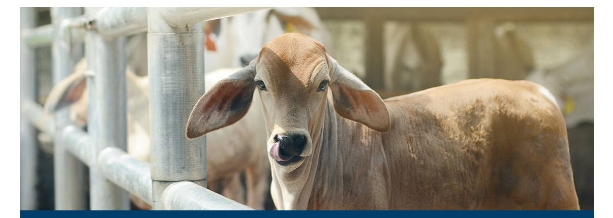
Monthly Update March 2023