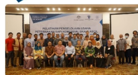
Business Management Training for Small Scale Commercial Livestock Business