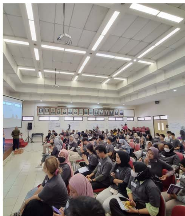
The training combined in-class and an outbreak simulation within the campus area.

"The training was very well received by the students who particularly appreciated the ability to immediately utilise new learnings in the outbreak simulation session. The training will now