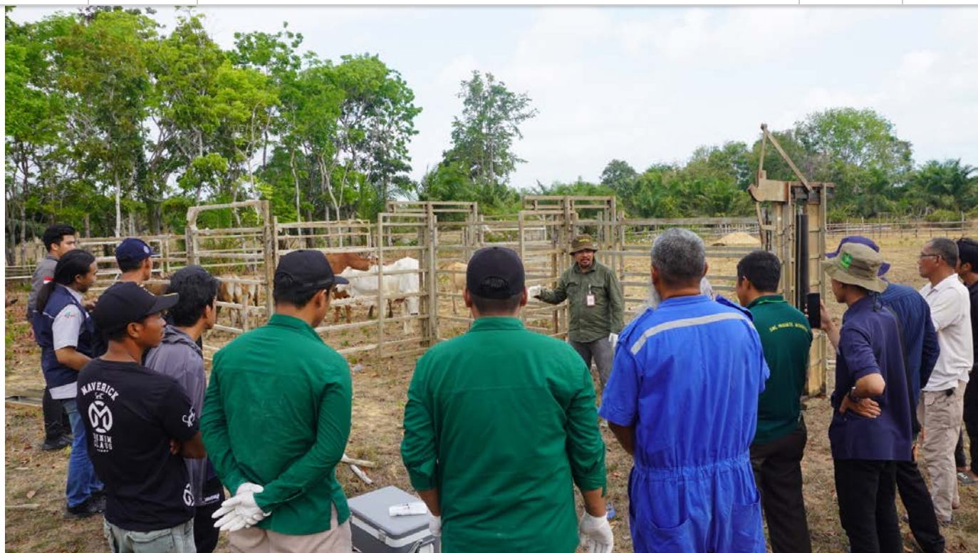
Smallholder farmers and government frontliners obtaining technical guidance on animal health and animal welfare in South Kalimantan.

October also saw 18 young farmers (7 females) complete their 3-month 'On the Job' training through the Bhakti Surya Training Centre in South Kalimantan and the Ministry of Agriculture, Entrepreneur and Employment Support Services (YESS) program. All participants received Ruminant Farmer Beginner Level Certification from the Indonesia National Professional Agency (BNSP). This certification will support new careers opportunities in the cattle industry and options to seek further government assistance.