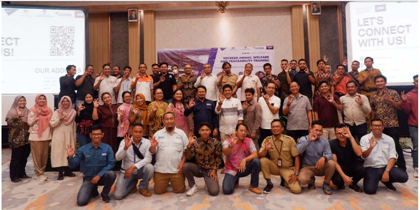
Cattle Industry players join the Animal Welfare and Traceability Training held by Forum AWO in Semarang, Central Java.

Most Australian cattle are being sold in the Greater Jakarta area where the market is greatest. But as the Indonesian economy grows in areas outside Jakarta, such as Central Java, so market for Australian cattle. Maintaining animal welfare and traceability through the Exporter Supply Chain Assurance System (ESCAS) in these areas is crucial, and key to sustain industry. The Forum Animal Welfare Association, which is supported by the Partnership, fulfills this need.