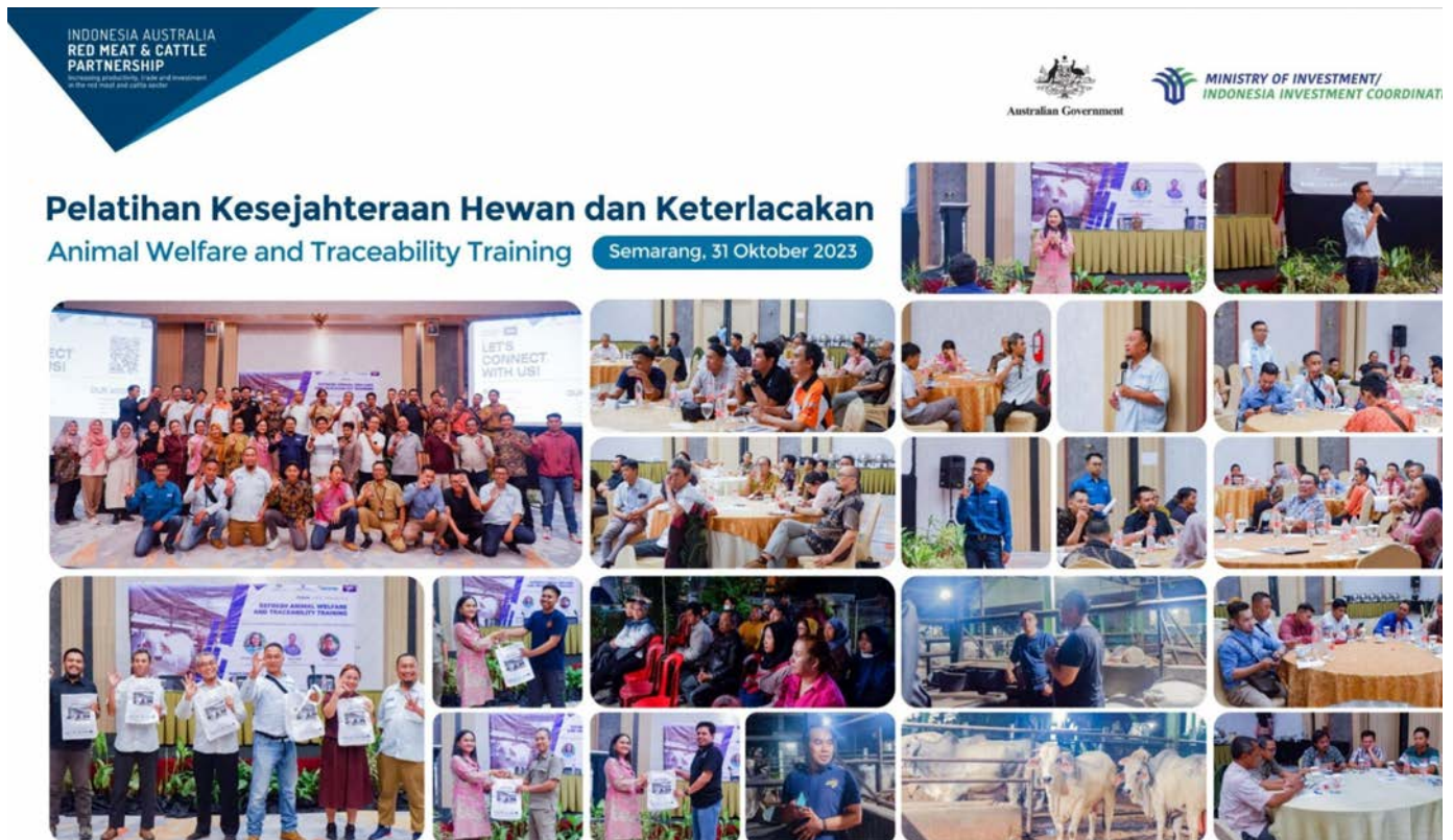
Members of the Animal Welfare and Traceability Training that focused on ESCAS implementation.

In October the FAWO trained 60 beef cattle industry representatives from Central Java on Animal Welfare and Traceability. Participants were introduced to the Australian cattle supply chain, from producers in rural Australia, transportation to Indonesia, fattening in feedlots, then slaughtering in abattoirs. Participants learnt of the importance of and how to maintain animal welfare at these stages. For example, they learned that good animal welfare improves the quality of the beef produced. The industry representatives were also introduced to Gender Equality, Inclusion (GEDSI) in the livestock sector, a session facilitated by FAWO Chairwoman who had previously completed a Partnership GEDSI Training of Trainers. The participants gained greater awareness of how inclusivity in livestock sector can improve productivity.