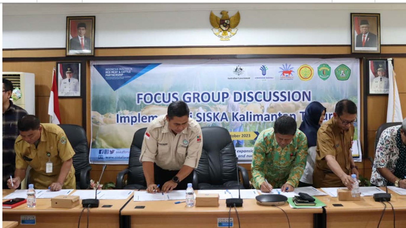
GAPENSISKA, the East Kalimantan Livestock and Animal Health Services Office and Estate Plantation Office, Regional Research and Innovation Agency, Mulawarman University and estate plantation (APKASINDO and GAPSI of East Kalimantan) sign an MoU to support Siska implementation in the province.

In October, the Siska Actors and Observers Association (GAPENSISKA), established and supported by the SSP, also strengthened its cooperation with key stakeholders to expand Siska in Kalimantan. A Memorandum of Understanding (MoU) was signed by GAPENSISKA, the provincial DINAS PKH and Estate Plantation Office, BRIDA, estate plantation associations APKASINDO and GAPSI of East Kalimantan. Collaboration between key stakeholders is essential for Siska expansion, so the MoU is an excellent step. The provincial DINAS PKH will now meet with stakeholders to strengthen understanding and support towards Siska expansion in the province.