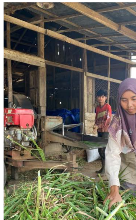
18 young farmers graduated from the third 'On the Job' Training YESS program in October 2023. During their 3-month training, the young farmers learned in-class and in the fields about farm logistics, feed management, and cattle health and reproduction.

Find out more about SISKAS Supporting Program here: in English and Indonesian .