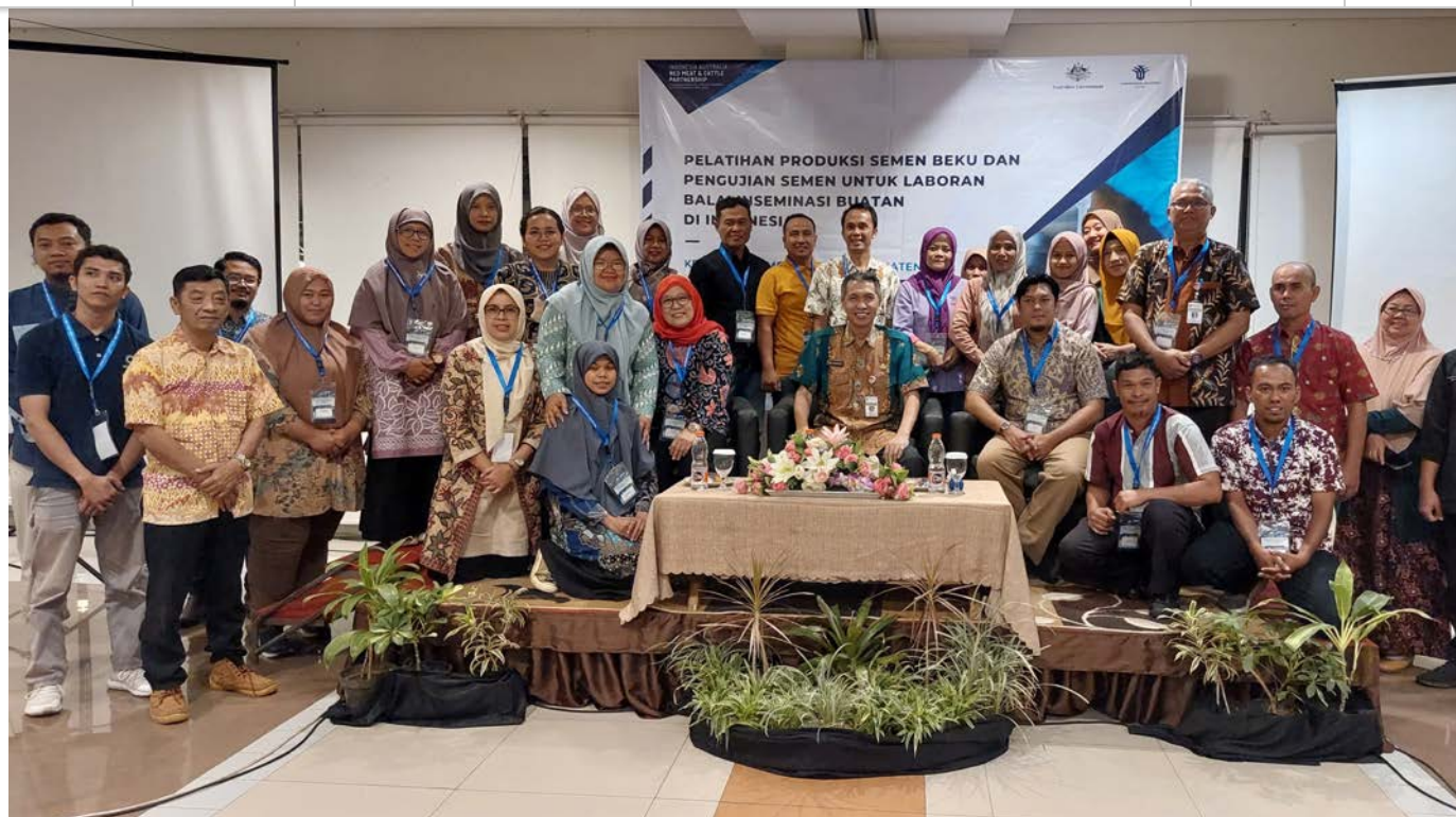
Trainers and participants of the first Technical Training on Frozen Semen Production and Testing for Artificial Insemination Centre Laboratory Technicians.

The training introduced the technical staff to the newly-developed standards, with the view to standardizing semen production and testing across Indonesia. Participants were equipped technical skills required by the minimum standards, including sperm morphology testing, frozen semen production, and quality assessment.