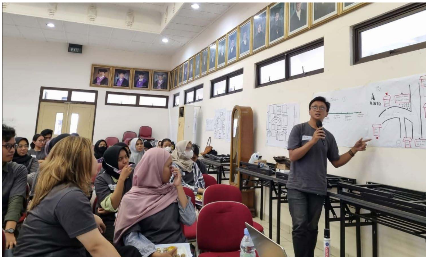
Animal Disease Outbreak Investigation Training for 126 veterinary students of Gadjah Mada University.

In October, 126 veterinary students (89 females) from Gadjah Mada University attended the Animal Disease Outbreak Investigation Training in Yogyakarta. This was the first of 16 training sessions for veterinary students to be delivered in 11 provinces. A similar training for 700 frontline technical staff commenced in early October.