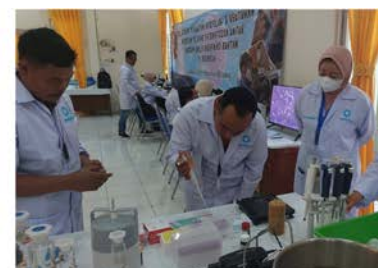
Trainers and participants of the first Technical Training on Frozen Semen Production and Testing for Artificial Insemination Centres. The training was the first national technical training provided to a Indonesia.