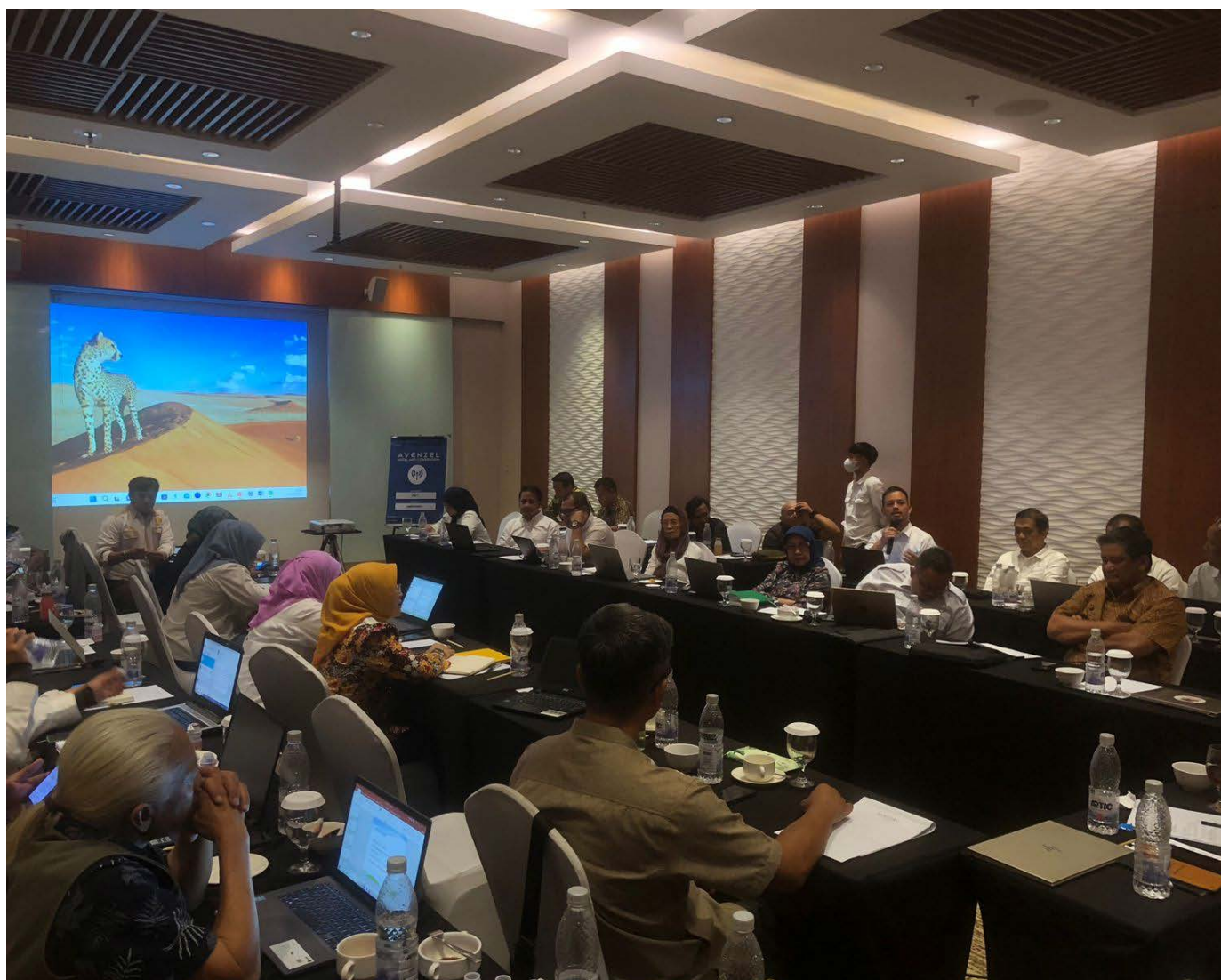
A focus group discussion on the National Strategy of Sheep and Goat Industry attended by HPDKI, government and industry representatives.

It was a busy month for the Indonesian Sheep and Goat Producer Association (HPDKI). The HPDKI, supported by the Partnership, ran a two-day focus group discussion (FGD) on a national strategy for the sheep and goat industry. The FGD brought together prominent stakeholders, including from the Directorate General of Livestock and Animal Health Services of the Ministry of Agriculture, a sheep and goat breeder association, and from farmer groups. All agreed on the critical need for a policy that requires breed validation and certification for all new imported sheep and goats. This will be critical to avoid fraudulent practice that would undermine the improvements in goat and sheep genetics from valid pedigrees. HPDKI will continue working in this direction, with national and sub-national government and the Partnership, through the development of a National Breed Plan and Industry Development Strategy.